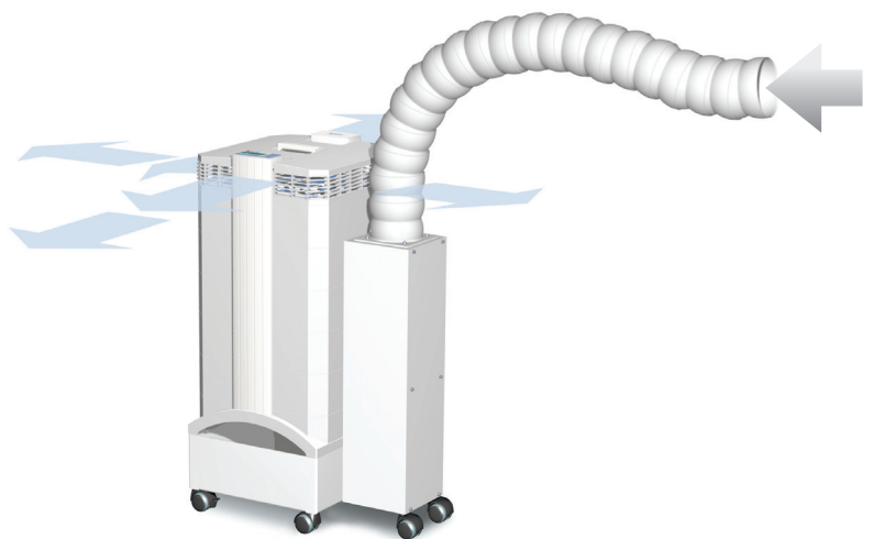
Principle of operation

The FlexVac accessory is compatible with all IQAir compact stand-alone filtration devices. The system cannot be used in combination with the following IQAir accessories: PF40 (coarse dust pre-filter kit), Mobility 56 (raised caster kit), InFlow W125 (ducting adapter kit) and the VMF (wall-mount bracket).